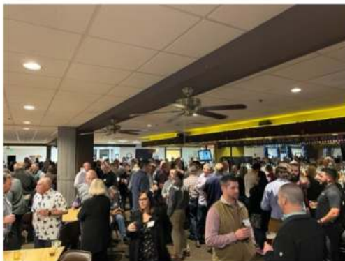
Huge crowds at Humboldt #63 Crab feed.

We have between 75-100 shooters each year. Bring a team and enjoy a day full of food & fun. Go to our new web site and sign up. We would love to have you attend. https://www.hoohoo181.org