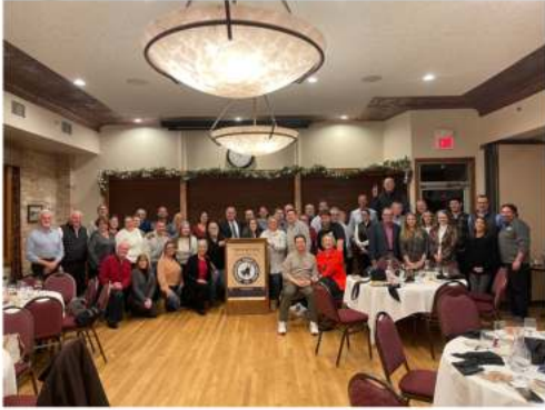
A great group gathered to celebrate the Twin City #12 & 100th year party celebration (held December 6th, 2022).

Looking at 2023, we are geared up for more events (long overdue with the pandemic):